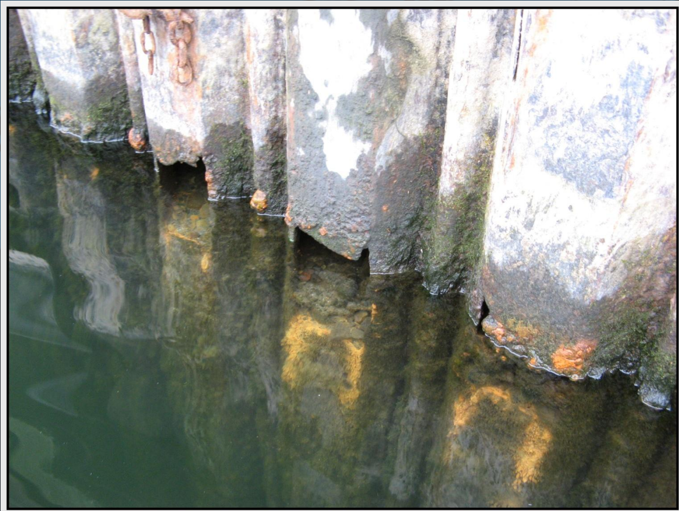
Existing steel sheetpile corrosion