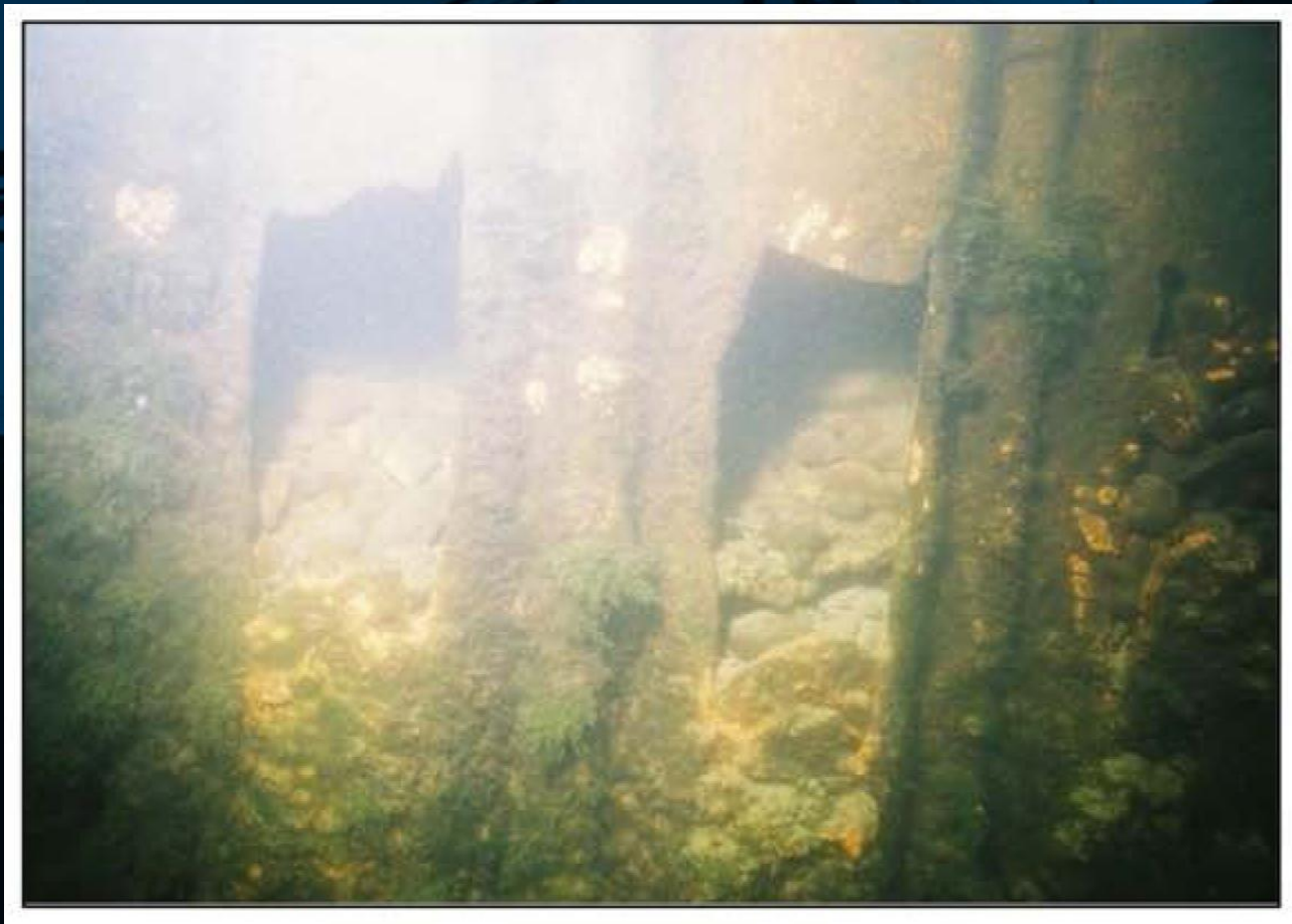
Existing steel sheetpile corrosion